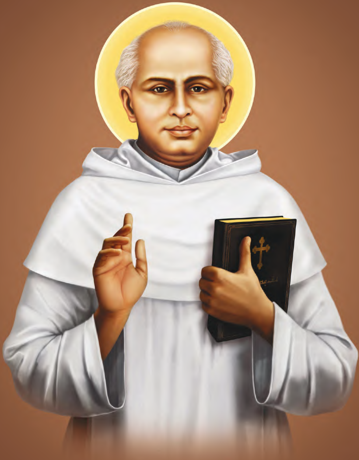
ST. KURIAKOSE ELIAS CHAVARA OUR FOUNDER 1805 - 1871